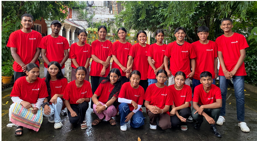
14th Cohort Fellows at the Welcome Program on 13 th July 2025

We are thrilled to welcome 19 inspiring new Fellows to the 14th Cohort, our largest yet. This brings the total number of Fellows we have supported to 140, with 90 active Fellows.