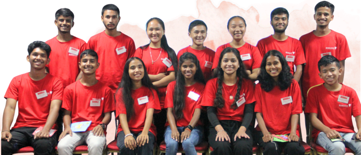
12 th cohort Fellows

The 14 Fellows from our 12th Cohort have completed their higher secondary education and are now being assessed for continuation into the Bachelor-level Fellowship.