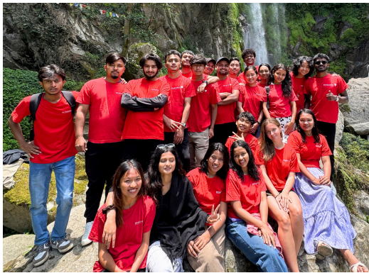
Fellows at the Mohini Jharana in Makwanpur

The Bachelor's Fellows embarked on a much-anticipated annual educational trip, an experience designed to blend learning, exploration, and community immersion. They traveled to Chitlang, a scenic semi-rural village just 30 kilometres from the chaos of Kathmandu.